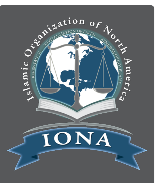
Repentance Revitalization of Faith Renewal of Covenant